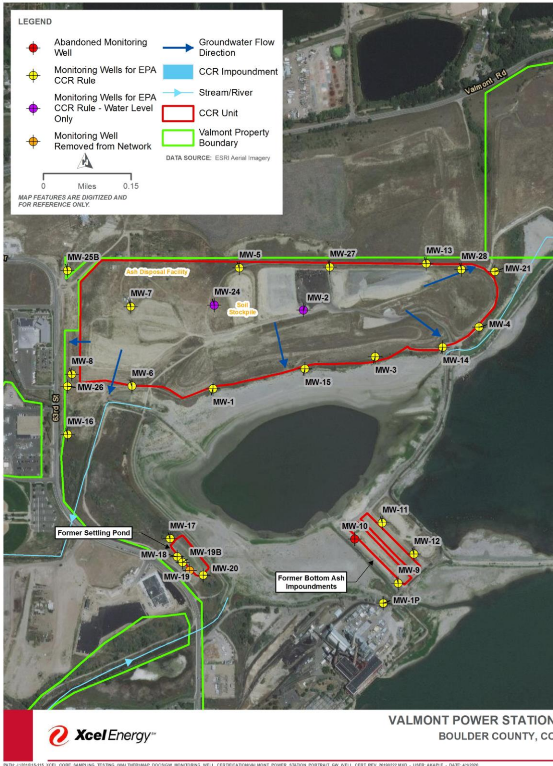
Figure 2. Valmont Station – CCR Units and Monitoring Well Location Map